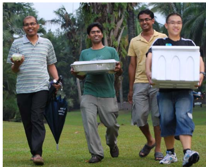
The strong men who were carrying our dinner.