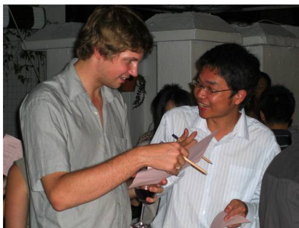
Two students interviewing each other to find a match for human bingo