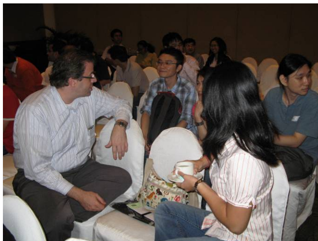
A chance for supervisors and students to interact

Overall, it was a productive day, presenting both an opportunity for supervisors and students to interact, and a chance for supervisors and students to voice any concerns that they might have. Personally, I felt that it was worthwhile for all of us to take a day out for the retreat, and hope that this becomes an annual event.