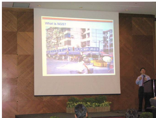
An NGS franchise in Shanghai?