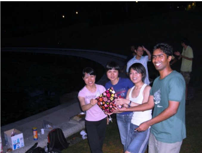
The big winner of the day, The Apple & Banana group

After we were sufficiently full, we played a rubberband-stick game. The winners of the Scavenger hunt, Apple & Banana group also won this game too! My my, the Apple & Banana group (picture below) did take their games seriously!