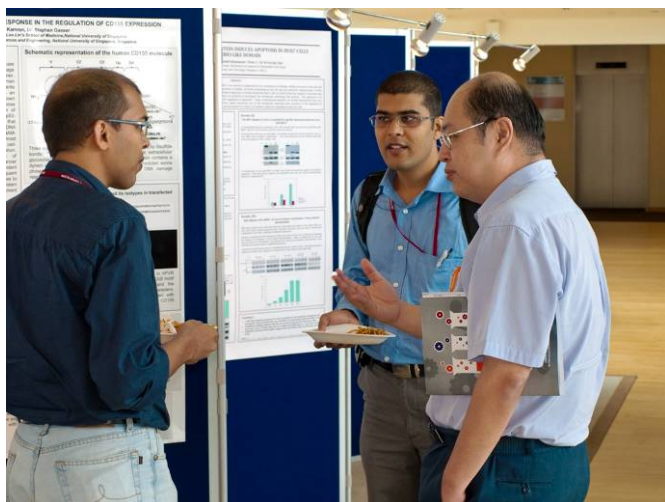
The symposium is a good chance for students and other scientists to interact.