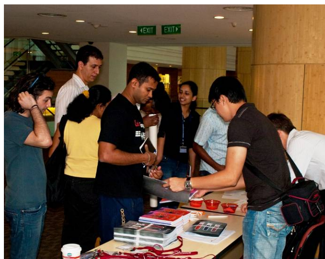
Registration of student participants