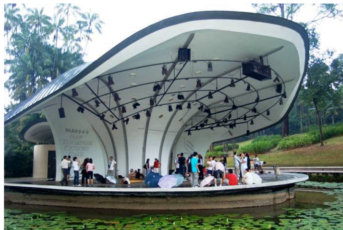
The symphony stage where we seek shelter from the cruel rain

The next event marked the highlight of the day...the scavenger hunt! We were divided into groups of 3-5 and were given a list of 10 things to find and take pictures with in the gardens. Everyone ran as if their lives depended on it. We had amused bystanders looking at us doing our strange poses and imaginative styles in front of the camera. Never have my leg muscles groaned so much!