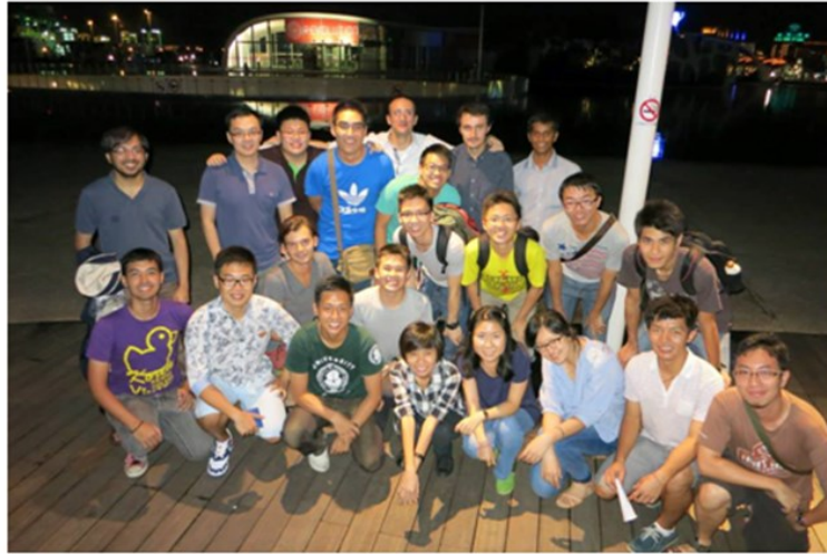
NGS Food Heritage Trail 2014

SINGAPORE (NGSSA) – 6 th August 2014 - Over 50 people from our NGS Family stepped away from their daily lives on this evening to take part in the first NGS event of the academic year, the “Food Heritage Trail”. This event replaced the usual Barbeque (BBQ) event as the “bonding” activity for NGS, in an effort to better foster the sense of belonging within NGS while having lots of fun at the same time.