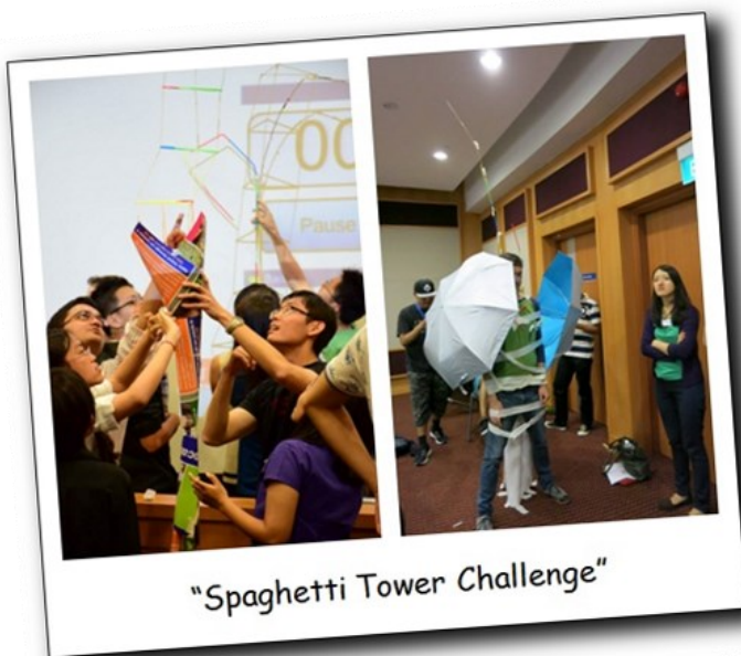
"Spaghetti Tower Challenge"

And what would an induction day be without food? Glorious food! Over lunch -- the first of many free meals as a graduate student -- and in a cozy environment like the NGS student cluster, our new students had the chance to mingle with their senior buddies.